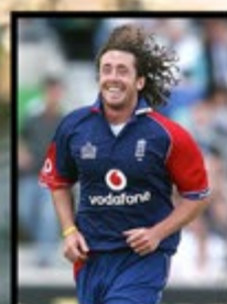
Ryan Sidebottom ENGLAND Yorkshire, Nottinghamshire