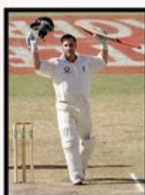
Graham Thorpe ENGLAND Surrey