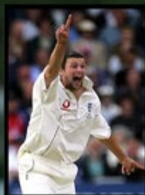
Steve Harmison ENGLAND Durham